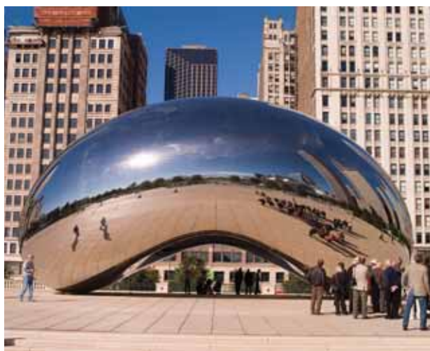
Cloud Gate is made of highly polished steel plates.