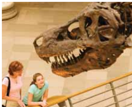
“Sue” is a Field Museum star.

brawling buildings. The city has been described as an international innovator in architecture since it was the first to create such masterpieces as the nation’s first skyscraper in 1884. The Willis Tower, formerly known as Sears Tower, is the tallest building in North America and the third-tallest building in the world. It rises to an impressive