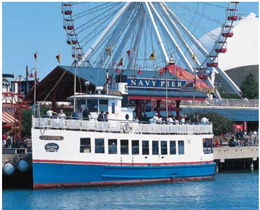
The Navy Pier on Lake Michigan is a popular destination for locals and tourists alike.

Created in 1848, The Illinois Michigan Canal connected the Great Lakes and the Mississippi River, which